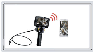
WiFi real-time image transmission