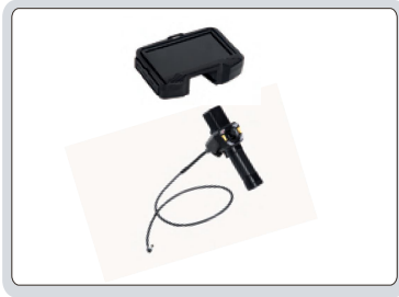
replaceable lens cable

TUNGSTEN WIRE WEAVED CABLE BREAK AND WEAR RESISTANCE